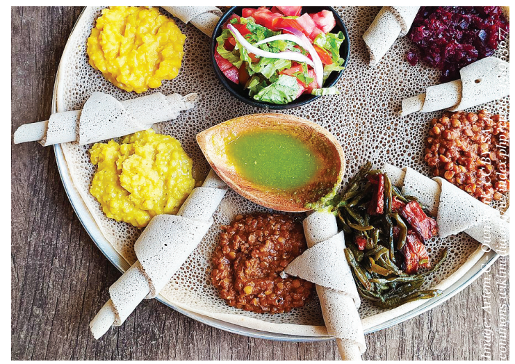
ECOLOGY ACTION'S GARDEN COMPANION

Generously grease a pre-heated 12-inch cast iron skillet. Pour in enough batter to cover the bottom of the skillet to form a flatbread of roughly 1/4 inch thick. Cover with a lid, and cook on medium heat for 3-5 minutes, until the top of the injera is dry (don't flip it over), then use a spatula to transfer the flatbread to a warm plate. Repeat until all the batter is used up. Enjoy! •